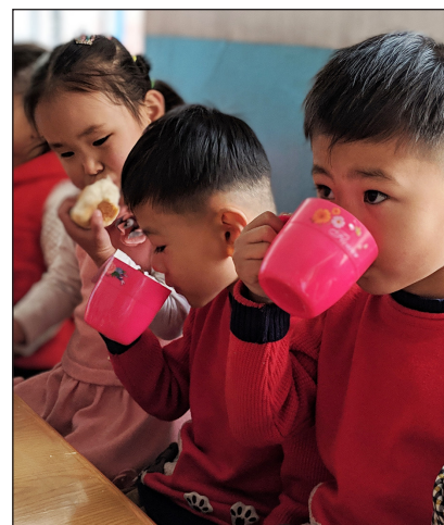
"The soymilk is really delicious."

To supplement their soybean crop shortfall, First Steps provided more than 50% of the beans for the Hyongjesan Supply Centre last year. Since the arrival of soybeans from Canada, they have been able to produce soymilk