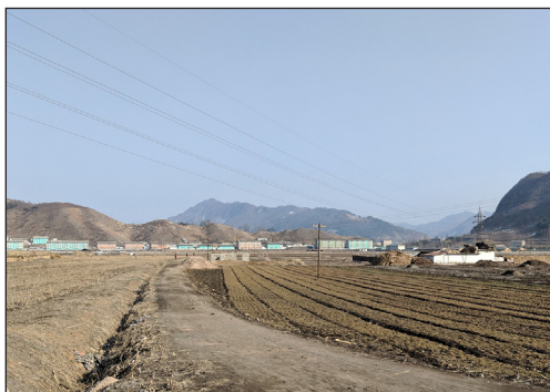
The fields of Dokchon are still recovering after floods.

During our December visit to Dokchon, we visited a soymilk production site, a daycare and a hospital.