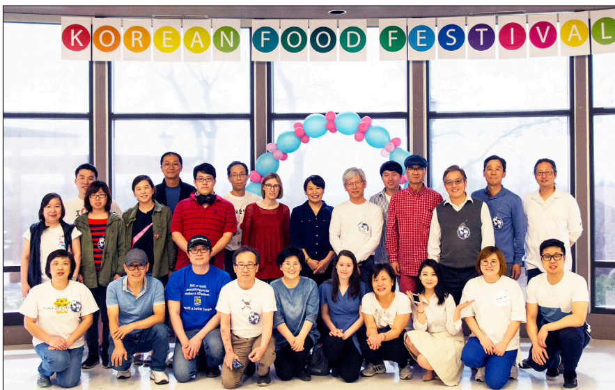
Some of our faithful Calgary volunteers at the Calgary Korean Food Festival, an annual fundraiser for First Steps.

We thank you, our multi-talented friends of First Steps. You are always on standby to help with editing, design or any other task that requires special expertise. You put your best into all you do for the sake of children and mothers you’ve never met.