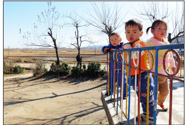
Children from Botan-ri Daycare in Tongchon during playtime.

one was well taken care of by the hard-working staff. None of us wanted to say goodbye!