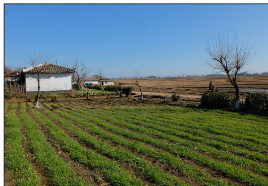
A vibrant field among the barren landscapes of Tongchon.