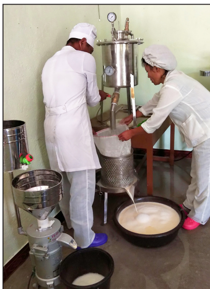
Workers prepare a fresh batch of nutrient-rich soymilk using the VitaGoat they received in 2019.

To the First Steps team’s delight, a new VitaGoat was put to work in Dokchon this past September. Although the machine had arrived only several months prior, the soymilk production staff were