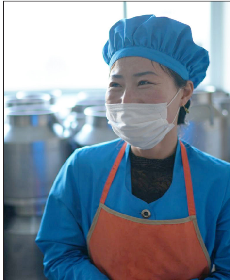
Mask donned, smile on, in Nampo Soymilk Factory.

it made no sense at the time, I told myself it was fine and that we would see them on our next visit.