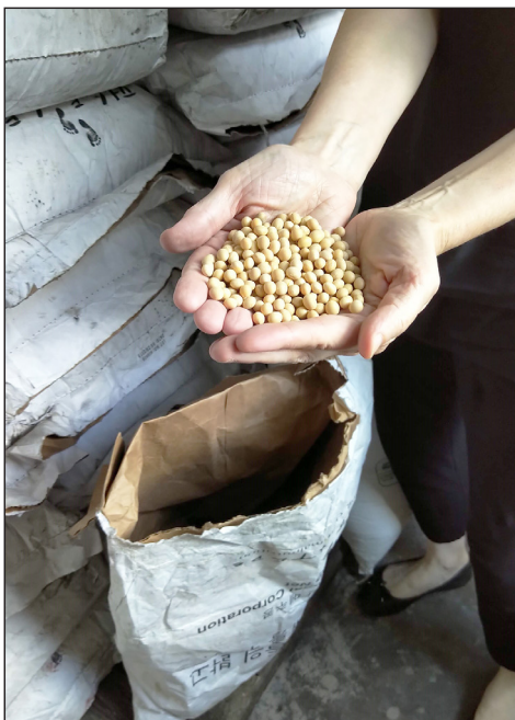
Each First Steps bag holds 30 kg of non-GMO Canadian Soybeans.

In North Korea, malnutrition and food shortages are a part of everyday life. The government gives priority to children in daycares, kindergartens and orphanages; however, in years of drought and floods even they aren't immune to shortages. One in five children aged five or under are suffering from stunted growth.