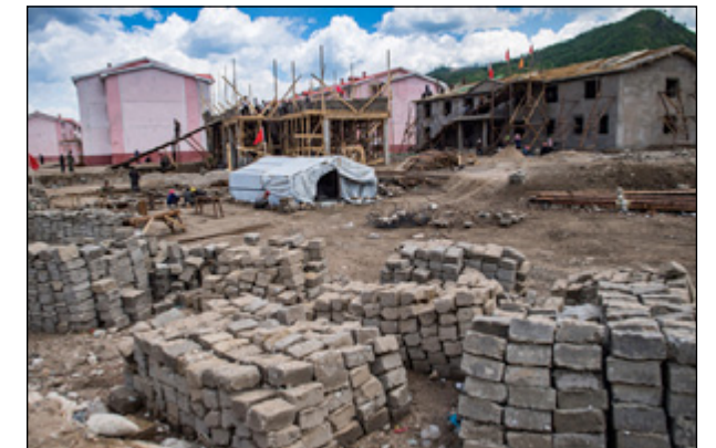
Building materials are piled for reconstruction in Yonsa.