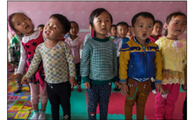
Children sing in Yonsa.