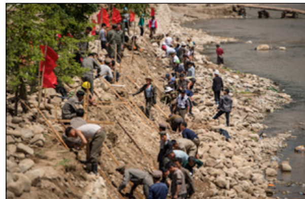
River bank is reinforced following last summers' flooding.

Yonsa is still in need of much help. Rebuilding is still in progress and will take time. The area lost almost a thousand acres of agricultural land where corn, potatoes and soybeans were planted. First Steps continues to consider what other ways we can continue to support this community. Please continue to keep the people of Yonsa in your prayers.