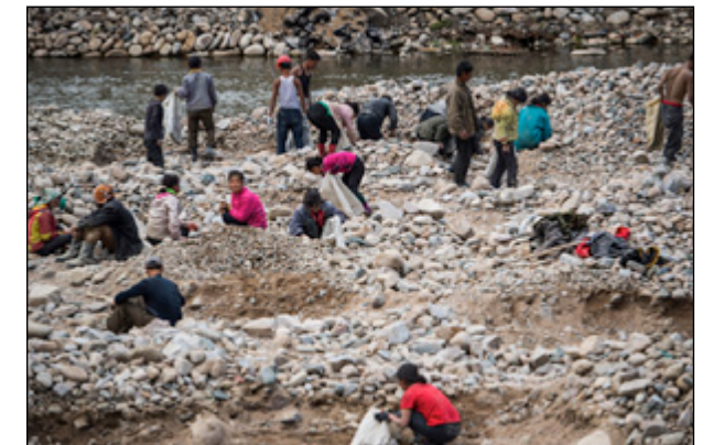
Workers clean up debris on flood plain.