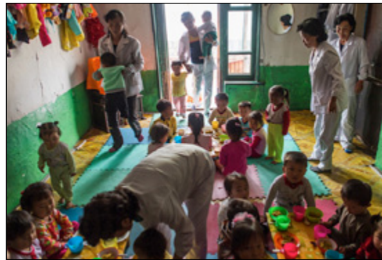
Children in Potae now receiving daily soymilk.

The team also visited a hospital in Potae that received Sprinkles. There,