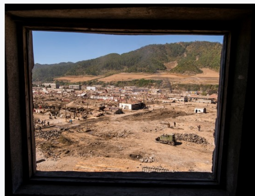
BEFORE: Yonsa Sept 2016