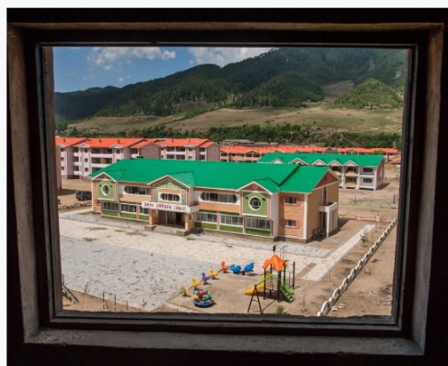
AFTER: Yonsa June 2017